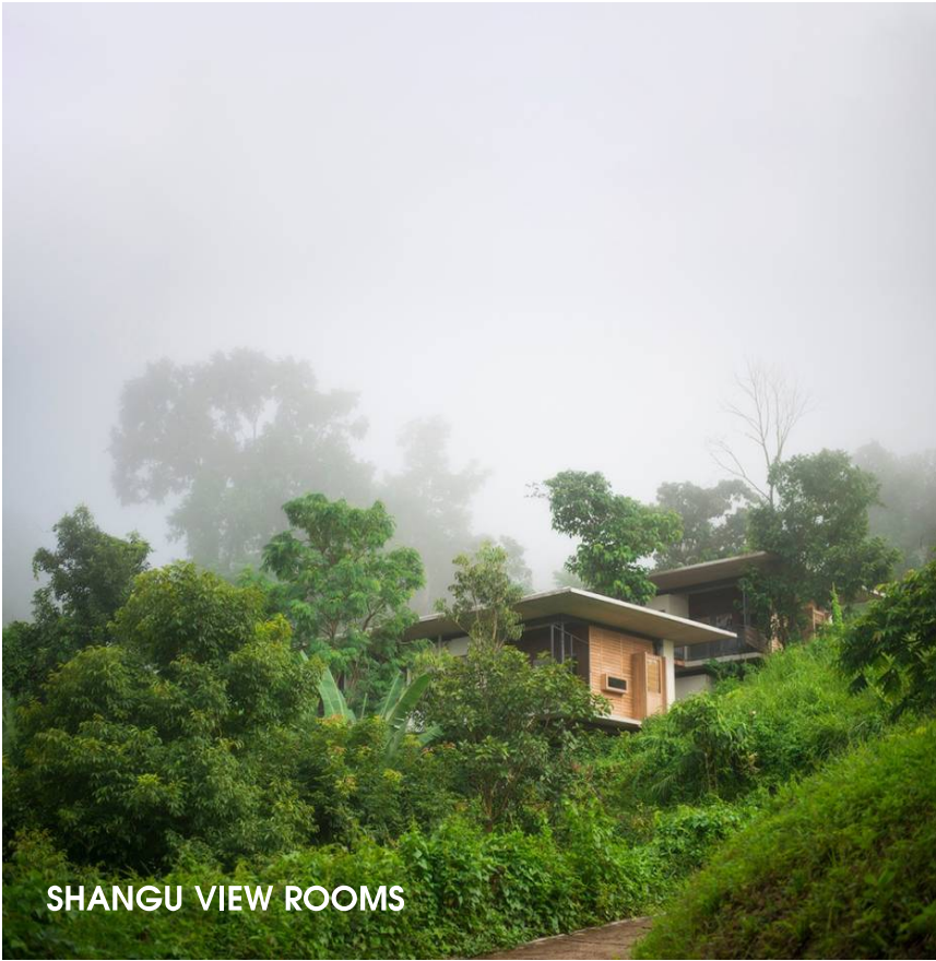
SHANGU VIEW ROOMS