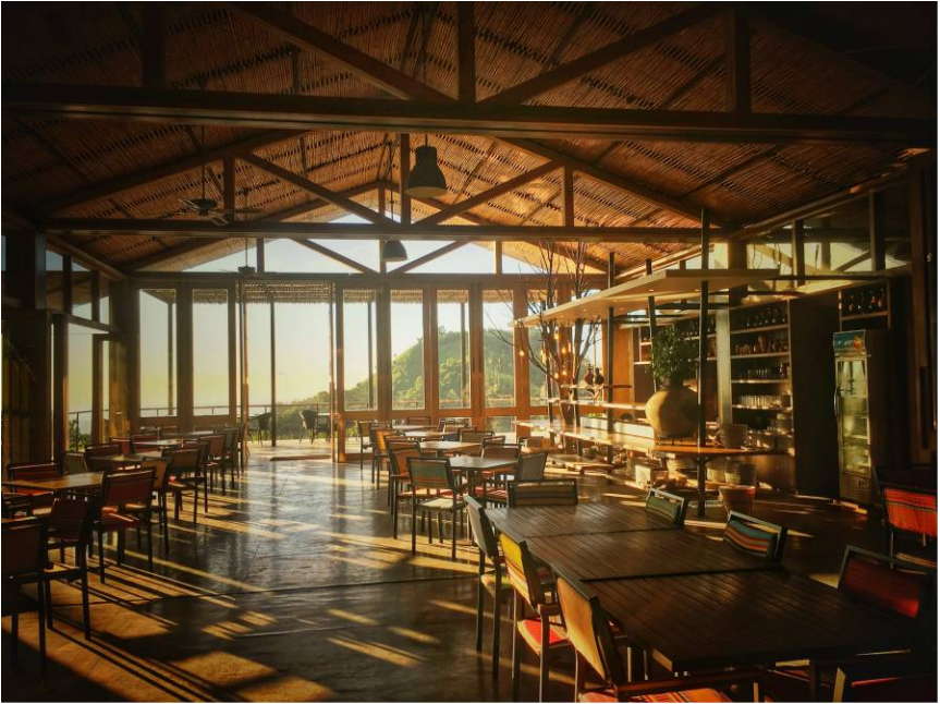
RESTAURANT (200 CAPACITY)